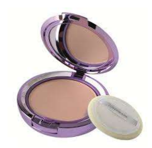
Figure 2: Compact blush powder

The pictorial representation of compact powder blush, loose powder blush and cream blush are shown in the figure 2, figure 3, figure 4 respectively.