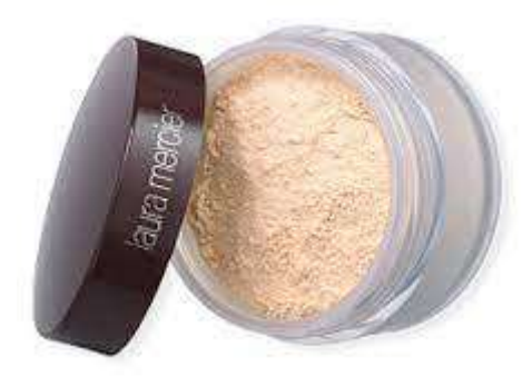
Figure 3: Loose powder