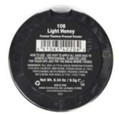
Figure 14: Label of compact blush powder

Label of a compact blush powder was shown in figure 14.