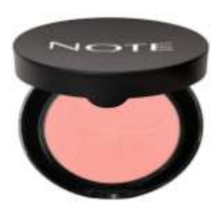
Figure 7: Compact blush

If you have fair skin, remember less is more to own a healthy flush. Select shades in pale pink or baby pink for a subtle glow 16. The pictorial representation of compact blush is shown in figure 7.