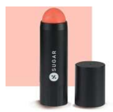
Figure 11: Blush stick

This cream-based stick is meant for onthe-go convenience. You can simply carry it around in your bag or makeup pouch. It's seamless in application and can be blended with a brush or fingers. The pictorial representation of blush stick is shown in figure 11.