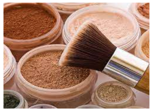
Figure 1: Different types of face powder

Powders are products that are intended to change the appearance of facial skin. They typically work by applying colour to the skin or through other effects such as altering the reflection of light or the shininess of the skin. Different types of powders used as cosmetics are foundation powder, blushing powder, H D powder, mineral powder, talcum powder, finishing powder, dewy translucent powder, powder, colour correcting powders etc<sup>4</sup>. The pictorial representation different types of face powders are shown in figure 1.