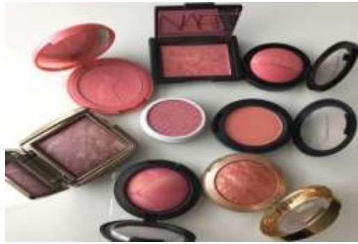
Figure 6: Different shades of compact blush powder

Different shades of compact blush are available in market. They are peppermint candy, mimosa, peach, strawberry, mauvette, pretty naked, healthy, berry, pink plum, cherry, plum, and chiffon<sup>15</sup>. The pictorial representation of different shades of compact blush powder is shown in figure 6.