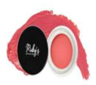
Figure 9: Cream blush

If you are looking for something organic and extremely long-lasting, then this blush is your savior. They will glide on effortlessly, feel weightless on your cheeks and will give you a natural dewiness<sup>18</sup>. To work your blush-first face, this and the tip of your ring finger is all you need. Cream blush works on all kinds of skin types and across all age ranges. But it's especially perfect for dry or more mature skin which always needs that extra bit of moisture. The one skin type that might have issues with cream blush is very oily skins, powder formula makeup will always be the better option. The pictorial representation of cream blush is shown in figure 9.