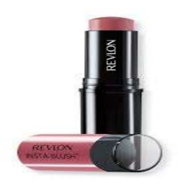
Figure 4: Cream blush